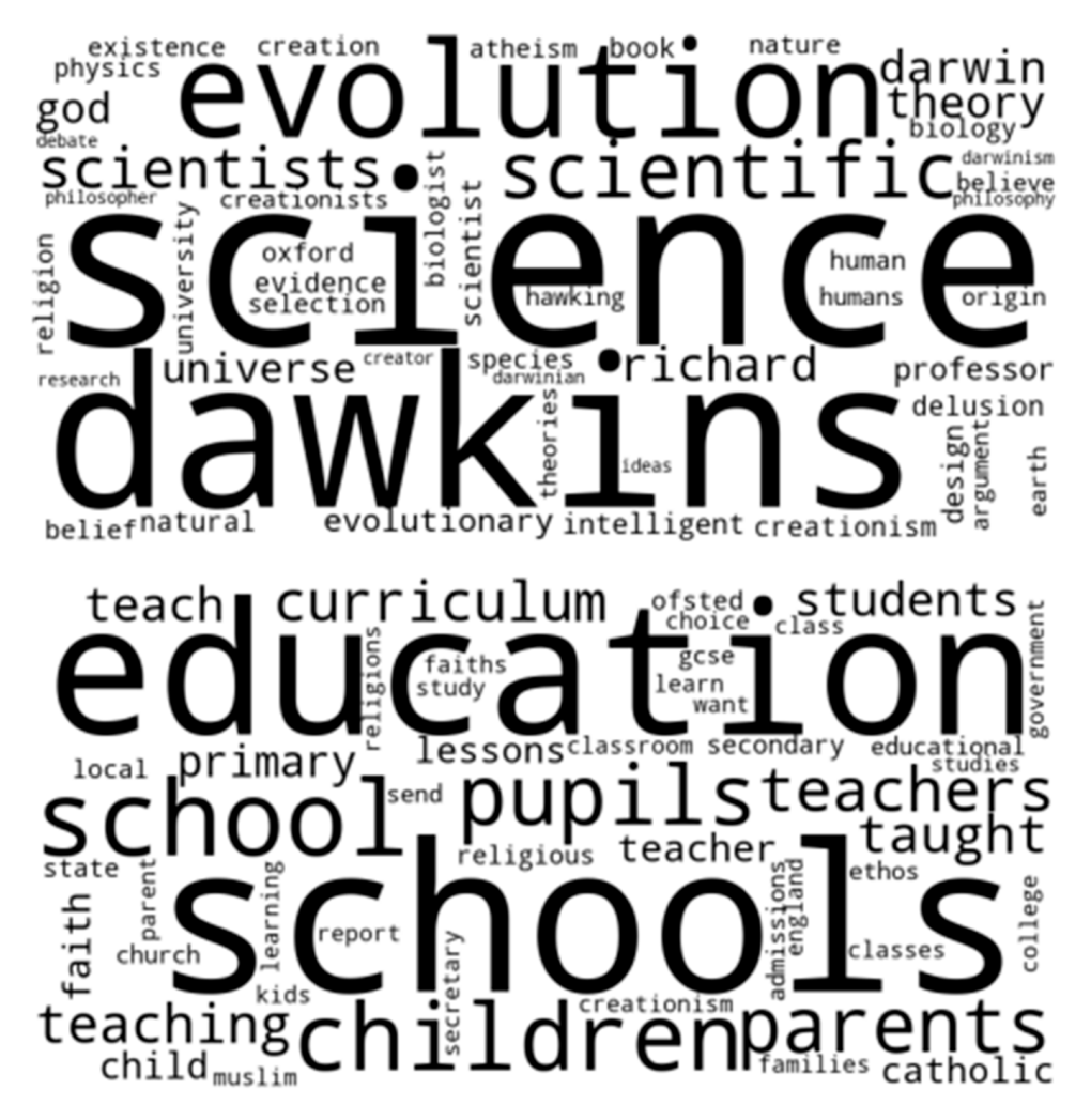
Figure 3. Word clouds for the "science" and "education" topics.

Table 2 provides a summary overview of the topics identified by our model. For each topic, it provides a category, a name, the top five words associated with the topic, and the share of articles in the corpus with that topic as the most important topic of the text for each country.<sup>5</sup> For each newspaper article, our algorithm produced a weighted list of the topics present in that article. In most articles in our corpus, four to five topics are present, though only a few of them are prominent: the average weight of the top topic within each article is 56.7%. The percentages in Table 2 take into account only these top topics.